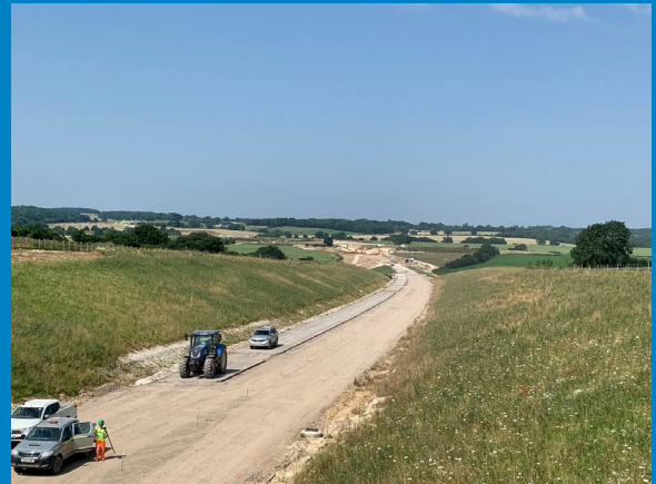
View along the River Ash embankment from Mill Mound cutting