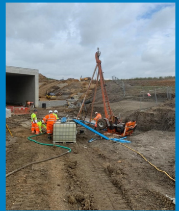
Drainage soak-away borehole testing