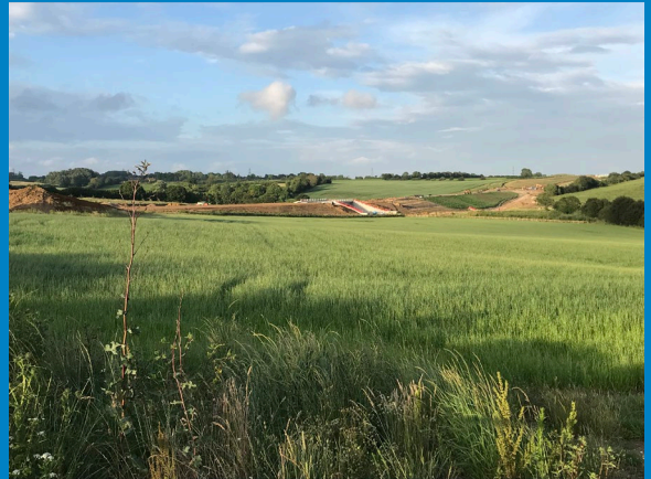
River Ash embankment in the distance – pictured in July

We will keep you informed of progress and when the flood alleviation elements are in operation.