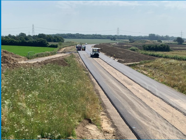
Looking east from Mill Mound Bridge