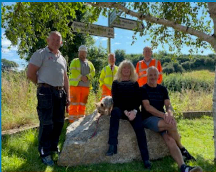
Representatives from the project team and Little Hadham Parish Council join together at the central village location of the puddingstone.