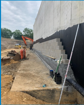
Back of wall drainage