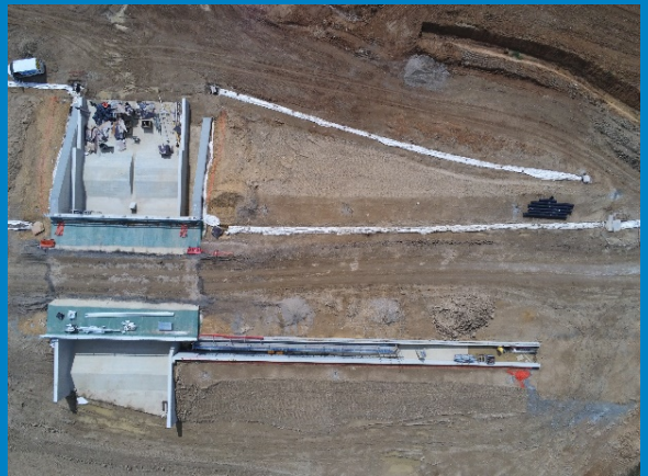
Albury Tributary aerial photograph