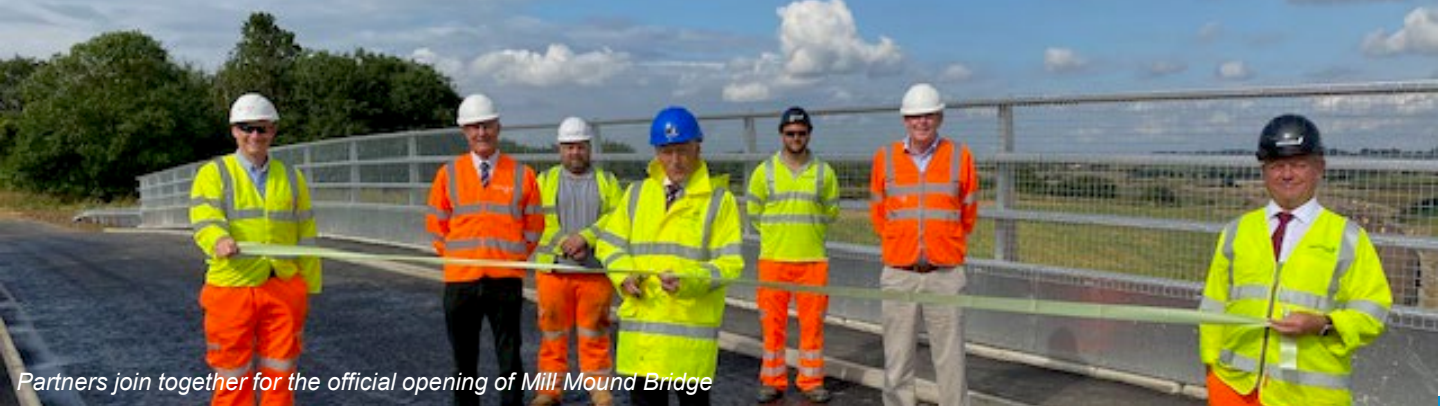
Partners join together for the official opening of Mill Mound Bridge