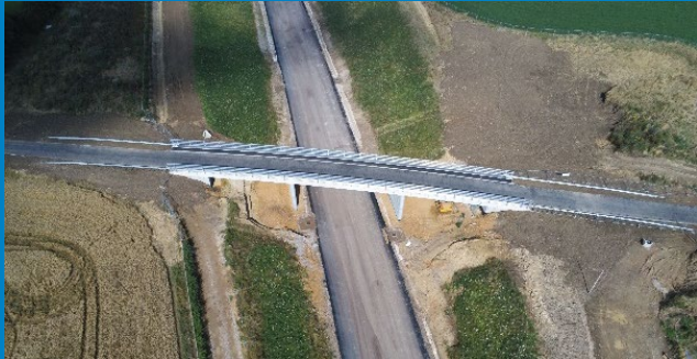
Mill Mound Bridge

Members of the project team gathered on site to mark the opening of the bridge on Tuesday 3 August.