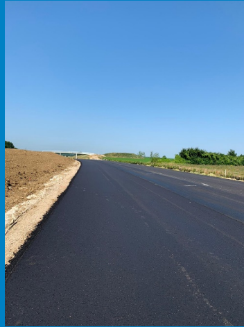
Surfacing works between Mill Mound Bridge and Cradle End Brook