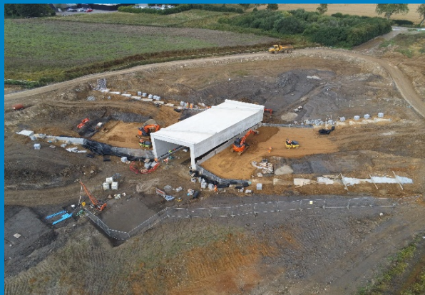
Hadham Park Underpass aerial view