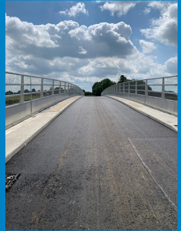
Bridleway and farm access track over the Mill Mound Bridge

Approximately 1.5km of the first layers of tarmac have been laid between Hadham Park Underpass and the River Ash embankment. There are another two layers to be laid on top of this to complete the road surface. The photographs show surfacing works progressing between Mill Mound Bridge and Cradle End Brook.